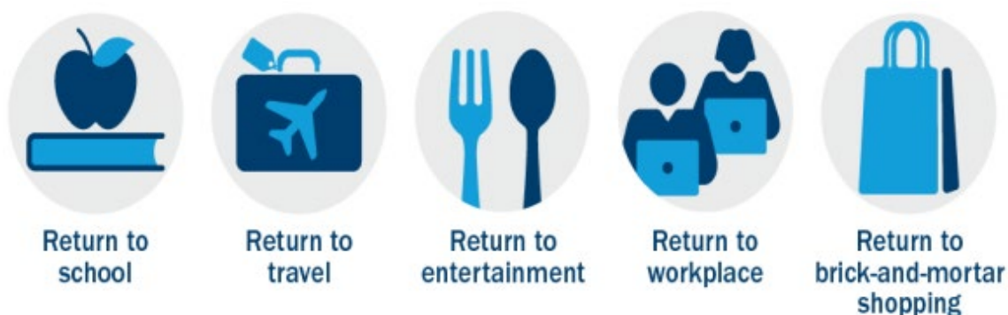
Figure 2: Tracking inputs

Our index suggests we are still 24% below pre-Covid activity levels. The levels of component activity vary: the return to brick-and-mortar stores is 17% below its pre-Covid level and a normal work routine is 20% below. The subcomponent with the lowest level is travel/entertainment: 36% below pre-Covid levels.